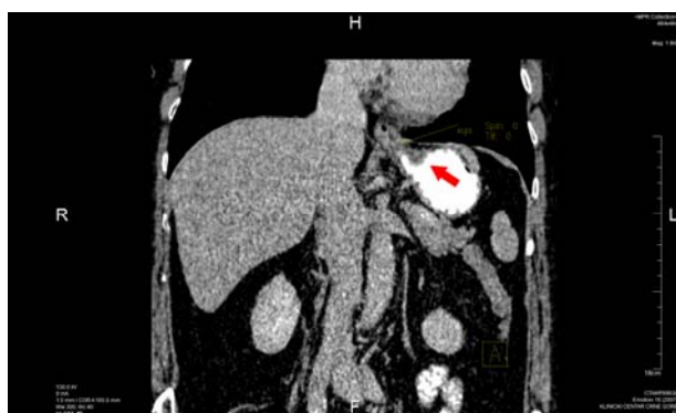
Fig. 1 – Multislice computed tomography (MSCT) with contrast showed unclear picture of tumorous lesion (red arrow) in gastric wall, near esophagogastric junction.

In diagnostic algorithm, a multislice computed tomography (MSCT) (16 slice) was performed, and clearly formed tumorous mass in gastric wall was found, circa 2 cm in size, with intact surrounding organs, but without possibility to differentiate if the mass was solid or cystic (Figure 1).